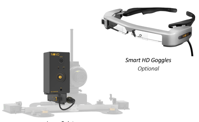
Laser Pointer Optional for the 3D Arc